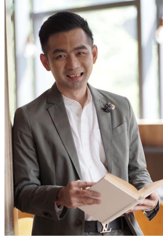
REGIONAL AREA HEAD CENTRAL 3 AJAX SOO